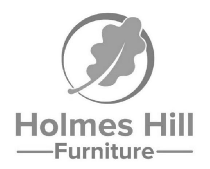
Holmes Hill Estate Whitesmith East Sussex, BN8 6JA